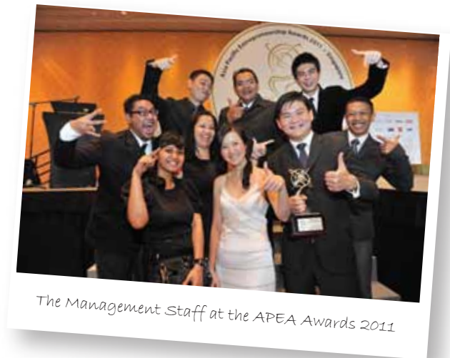
The Management Staff at the APEA Awards 2011

Now, ACP, the leading local Education and ICT Solutions provider is taking its first step towards globalization. ACP is expanding its business overseas by opening a new representative office in Philippines. Our workforce has also grown substantially to support the number of growing projects that we have won.