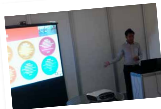
ACP's product manager showcasing our product and services at the EduTech 2011 @ NanyangJC

This is a giant leap for ACP as well as a promising move to cement ourself as the premier solution provider for our clients. With the dedicated teams and talented management staff helming our ship, we are optimistic and excited with what 2012 may bring!