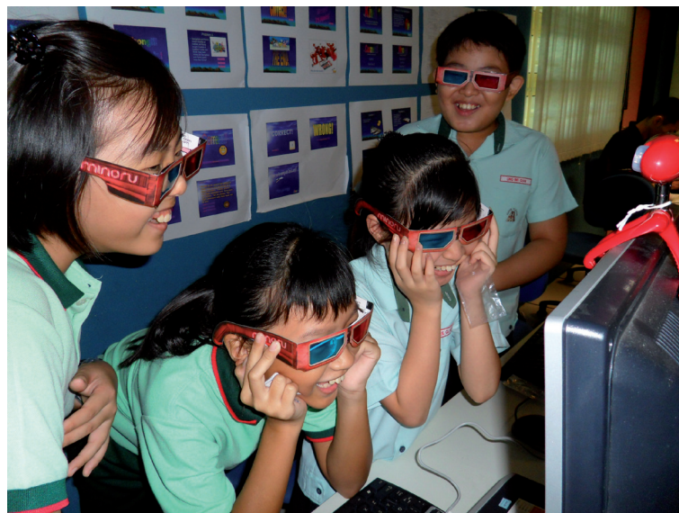
Students attending one of the Social Media 21 workshops

For more information about Social Media 21 please visit www.acpcomputer.edu.sg/socialmedia21