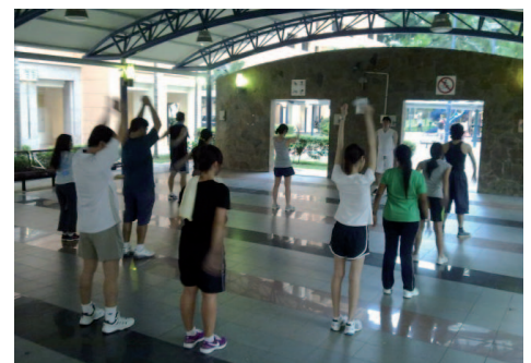
The ACP staff warming up before the run.

Running like other forms of exercise is a great way to battle stress, obesity, and may even relieve mild depression. This is one of the reasons why ACP has embarked on a regular fitness session by jogging every other week. Our staff has reported that they enjoyed the run - especially that euphoric, clear and calm state they felt after completing the 2 km jog!