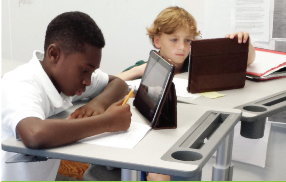
Alexandria Country Day School students (Alexandria, Virginia) at their LearnFit desks