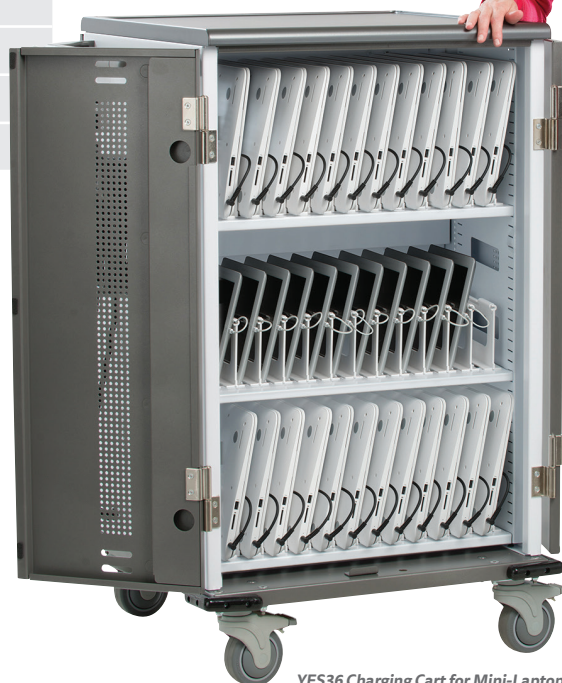
YES36 Charging Cart for Mini-Laptops