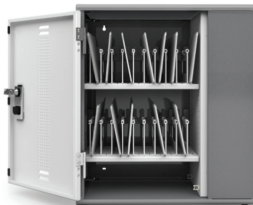
YES20 Charging Wall Cabinet for Tablets